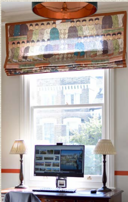
Oriental officials fabric with brick red border