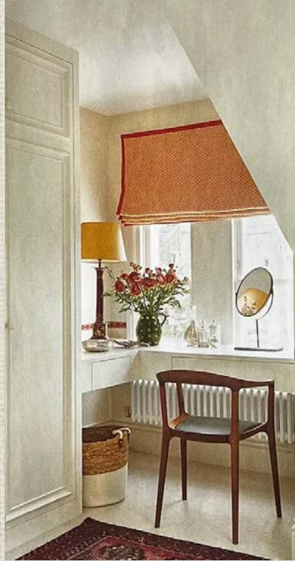
A blackout linen blind in a dressing area