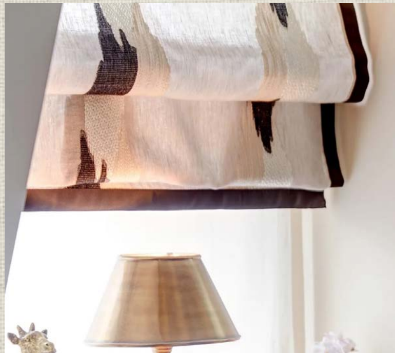
An embroidered sheer Roman blind with black grosgrain ribbon border