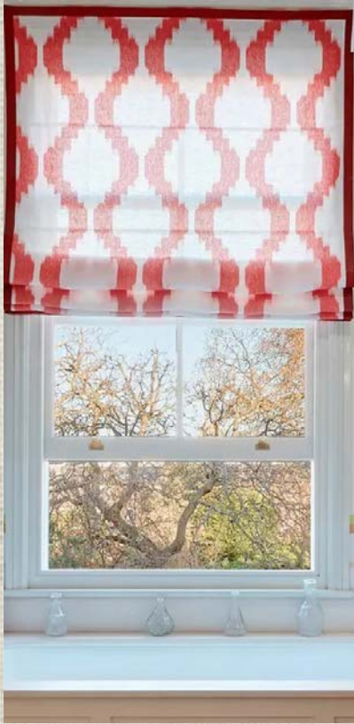
A sheer roman blind with deep red border