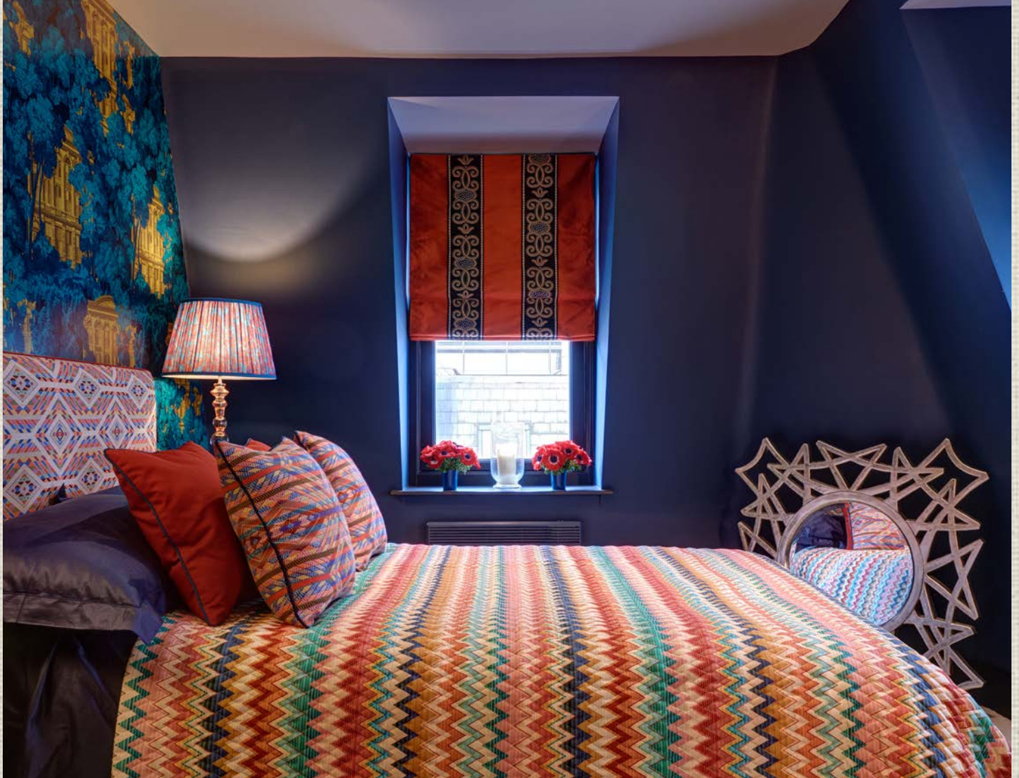
A silk roman blind at the end of a colourful and moody bedroom in the City of London. The silk fabric with its two lustrous embroidered stripes has such strength on its own there is no need for a trim or border for this blind.