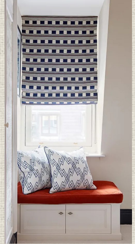
A blackout blind with a window seat below in the City of London